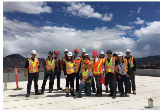
Trades and Transitions Coordinators tour the new TRU Trades building

Samplers are eligible for dual credit, earning 16 credits toward high school graduation and a possible credit for three first-year general studies courses at TRU. That's three first-year TRU courses for the cost of your application fee of $28.68. See Mrs. Monkman for applications.