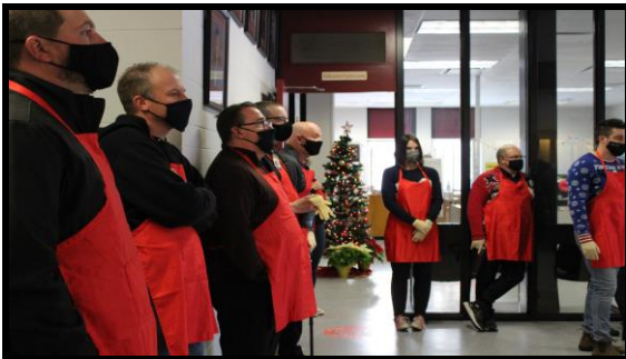
Volunteers to serve, prep and cook.